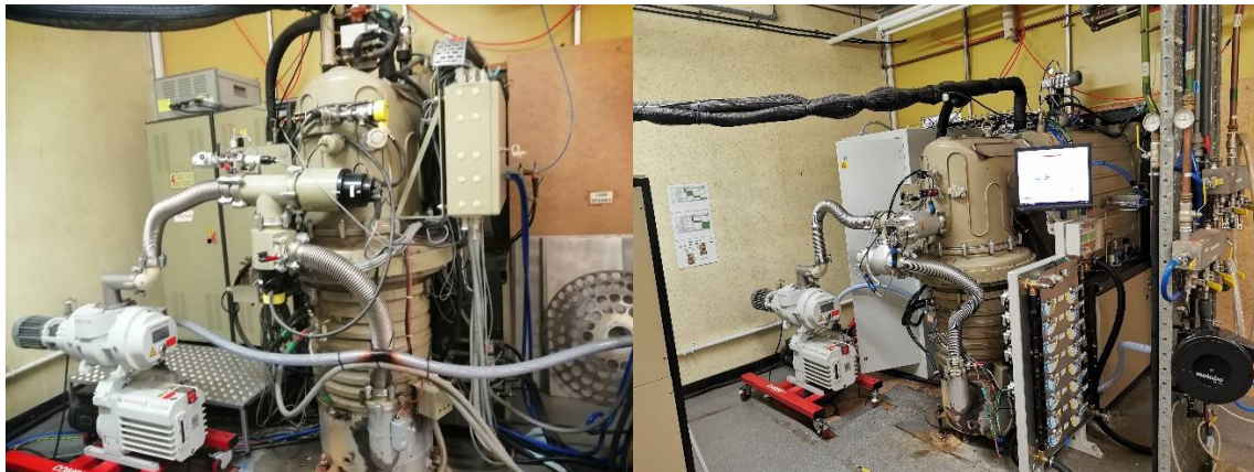
A BAK760 coating system, pre-upgrade

When it is not possible to remove a system from the cleanroom easily, or where the disruption must be kept to an absolute minimum, we can still offer a WAVE upgrade. Some compromises must be considered, however in a matter of a few days we can turn an old, unreliable system into an up to date tool featuring our latest process controls.